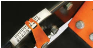
CUTTING DEPTH INDICATOR