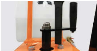
SMART CUTTING-DEPTH LOCKING